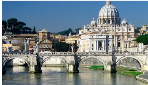
Rome: Baroque Rome (optional).

TODAY'S HIGHLIGHTS: City tour of Rome. Roman Coliseum (admission price included). Indian dinner in the Trastevere area. In the morning, we have a scenic tour, which will be a great introduction to "The Eternal city". We will visit the tiny state of the Vatican, the epicenter of Christianity in the world. You will be able to visit St. Peter's Basilica. We have included admission to the Roman Coliseum, the symbol of Rome. This impressive construction dates back 2,000 years and will transport us in time so that we can learn about ancient society in the Roman Empire. At the end of the evening we arrange a transfer to Trastevere area for a stroll in the narrow cobbled streets of the district with hidden treasures, such as some modest medieval churches, small shops with the most peculiar of objects or scenes of daily life. Indian dinner included. Return to hotel.