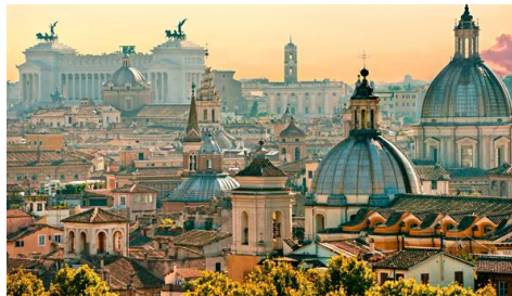
Rome: The eternal metropolis.

*The general terms and conditions of the Europamundo 2019/20 Brochure apply