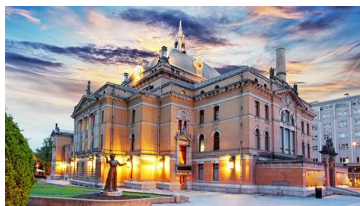
Oslo - National Theatre, Norway